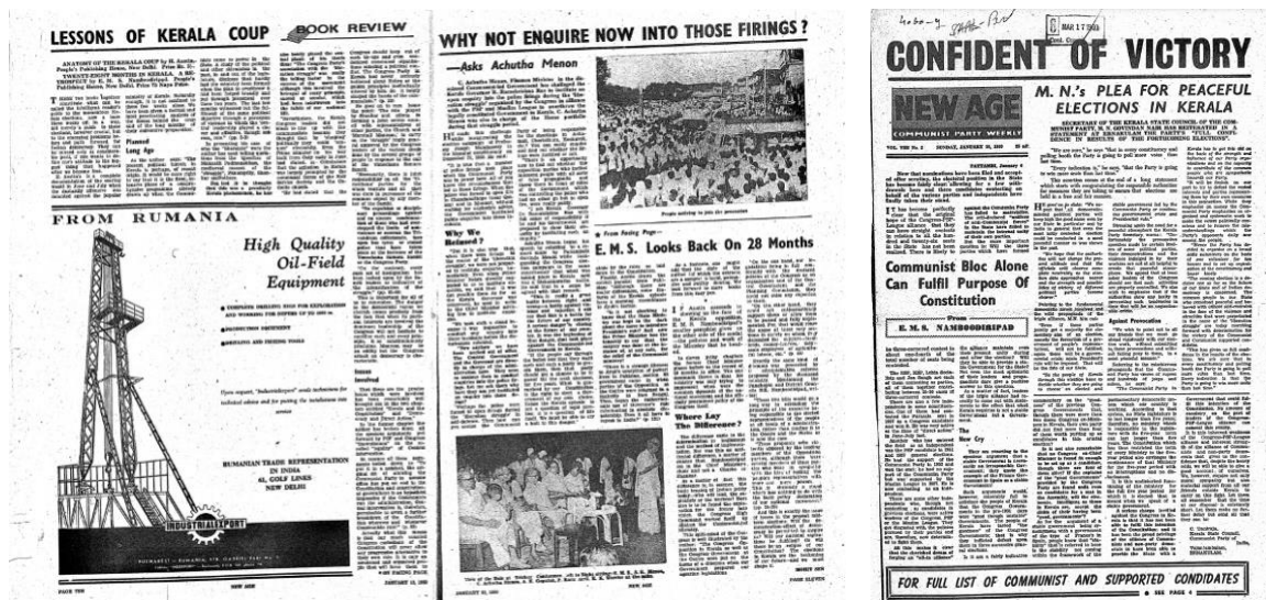
Figure 2.1: Various excerpts covering Kerala in New Age Volume VIII No. 2.

A particularly Kerala-heavy issue of New Age dedicated 7 out of its 15 pages to the state and in various ways invoked caste, though rarely explicitly. 67 Similar to the above, caste organizations are mentioned in passing antagonists to the CPI, but more interesting is the in-depth analysis of Allepey, a State Legislature district which was then reserved for Dalits. In the two-page spread, there are no usages of “harijan,” “backward,” or any other words that are traditionally associated with oppressed-caste groups. There are, however, multiple mentions of “peasants” in the district, which can be interpreted as 1) an intentional papering over of caste identity in favor of the economically-based label of peasant, or more likely 2) a lack of attention paid to caste identity. In the same way that EMS uses specific Malayalam terminology that depicts Dalits as a subset of “workers,” this New Age spread euphemized Dalit struggles by focusing on the class- rather than caste-character of their identity.